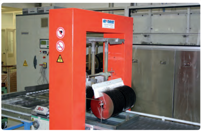
Low-frequency demagnetization tunnel for the demagnetization of saw blades.