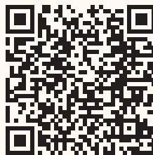
Products you may also be interested in: magnetic metal conveyors, nail aligners and timing belts. See the brochure on www.goudsmitmagnets.com or request one.